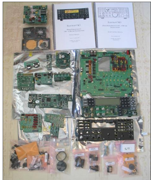
"Some assembly required..."

some rigs, but the display that it does have is very legible from the darkest room to the brightest sunshine. The noise-fighting tools it possesses are amazing. It includes both a hard-